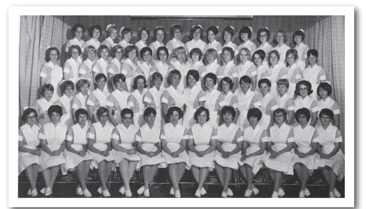
Members of the Nurse Chorus, 1968