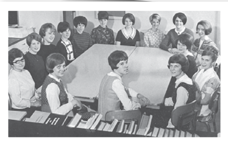
Members of Student Council (1968)