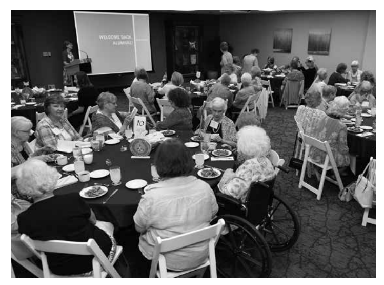
Alumnae gather for the reunion luncheon.