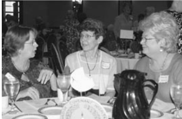
Friends enjoying the Luncheon