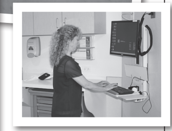
Mounted workstations in each patient room provide more space for patients and staff.

Nursing stations are equipped with ample workstations, and also face patient rooms.