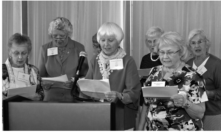
Members of the class of 1954 recited a poem based on South Pacific during Roll Call.