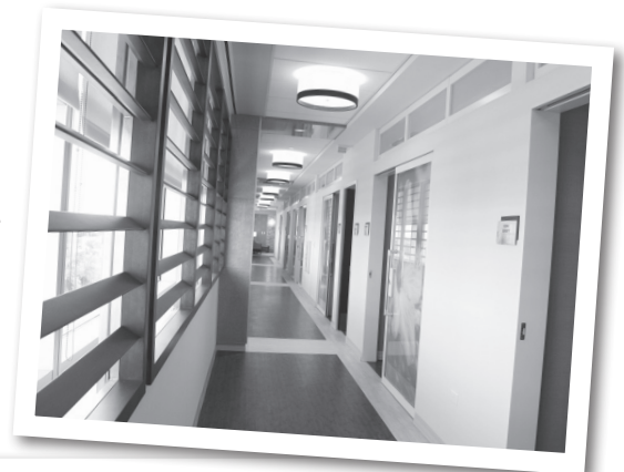
This patient-only hallway ensures a private and relaxing experience.