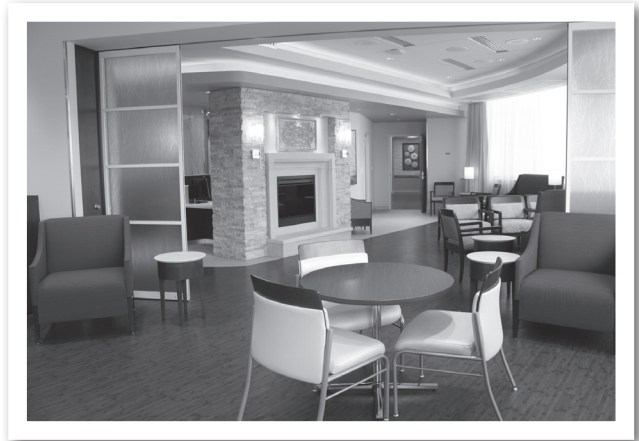
The Women's Health Center waiting area is connected to the Resource Center. The Resource Center will be staffed with retired nurse volunteers.